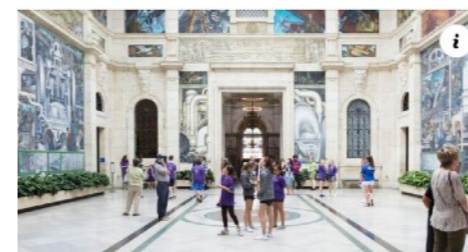
10best.usatoday.com Best Art Museum (2024) - USA TODAY 10Best Readers' Choice Awards

The newspaper USA Today ranked DIA first in its "Readers' Choice Museum" for the second time last year. It won this award, beating out strong competitors such as the Art Institute of Chicago in 10th place and the Milwaukee Art Museum in 8th place! Article: Please see here https://www.10best.com/awards/travel/best-art-museum-2024